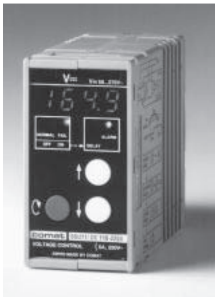
WHD: 38x72x92 mm

With these devices, Comat has set new, trendsetting standards in voltage monitoring. The high accuracy of measurement and functional reliability also permits unconventional applications and increases the operational safety of your system. Let us know your problem - we can find a solution together.